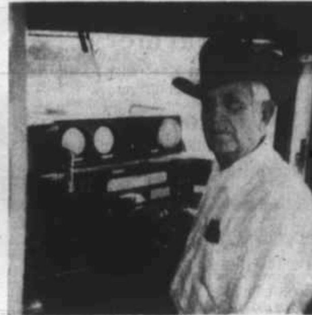
Working last run