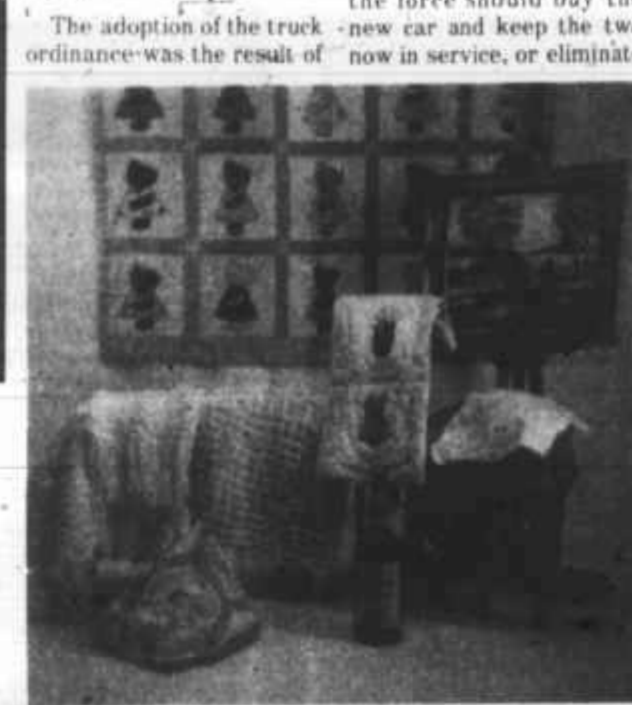
Some of the items that will be auctioned off Saturday night to raise funds for the ambulance being purchased by Sheridan Emergency Aid.

A city ordinance was adopted here Tuesday prohibiting loaded or partially loaded trucks with more than six wheels from using city streets, either for transit or parking, unless making deliveries or going to repair facilities. Unloaded trucks may be driven to the homes of owners, but may not be parked on city property. That council action was part of the agenda that included discussion of bids for a new police car, and the preliminary presentation of the budget for the next fiscal year which begins April 1. The adoption of the truck ordinance was the result of